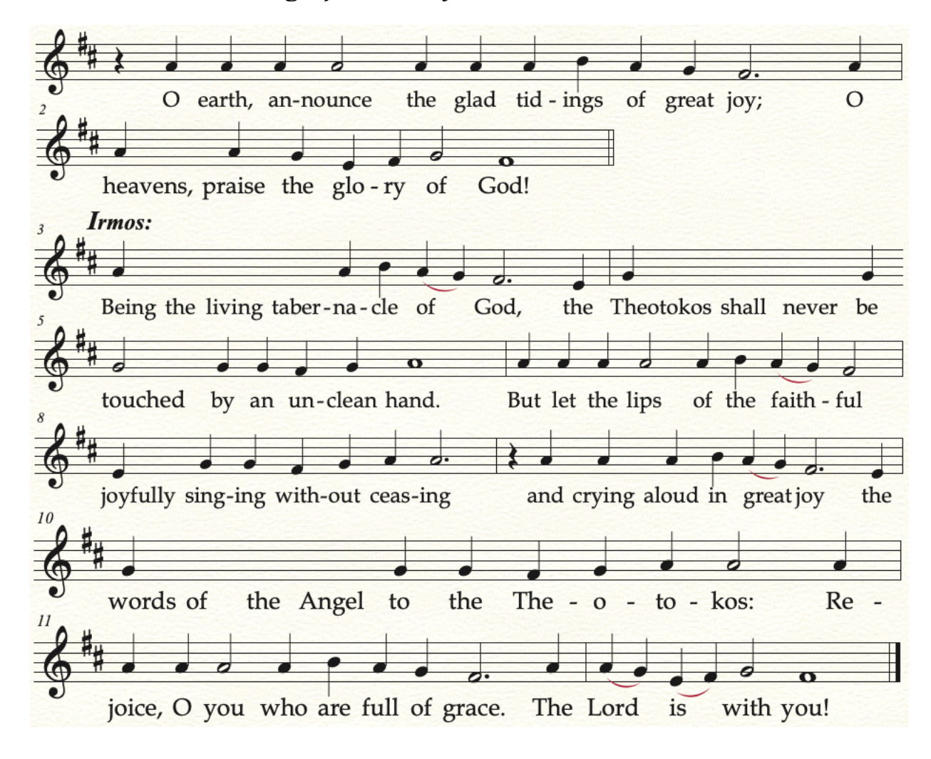
The Communion Hymn - Psalm 132:13 (LXX 131))

The Lord has chosen Zion; He has desired it for His dwelling. Alleluia.