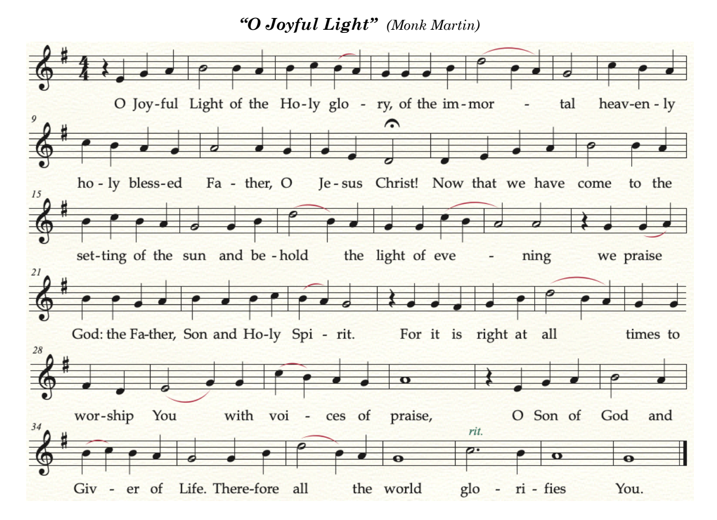
Liturgy begins with the singing of the Troparion & Kontakion.