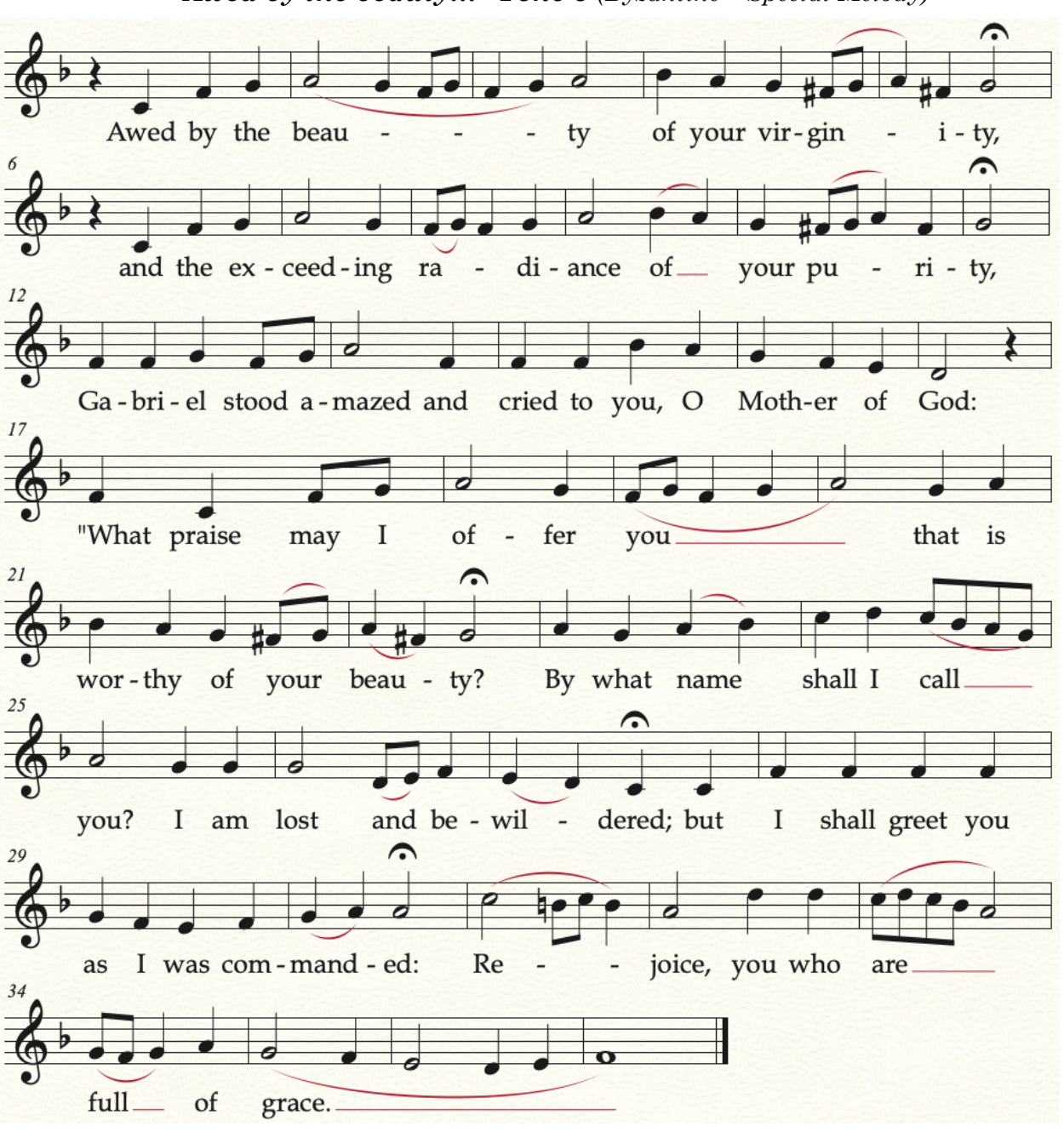
"Awed by the beauty..." Tone 3 (Byzantine – Special Melody)